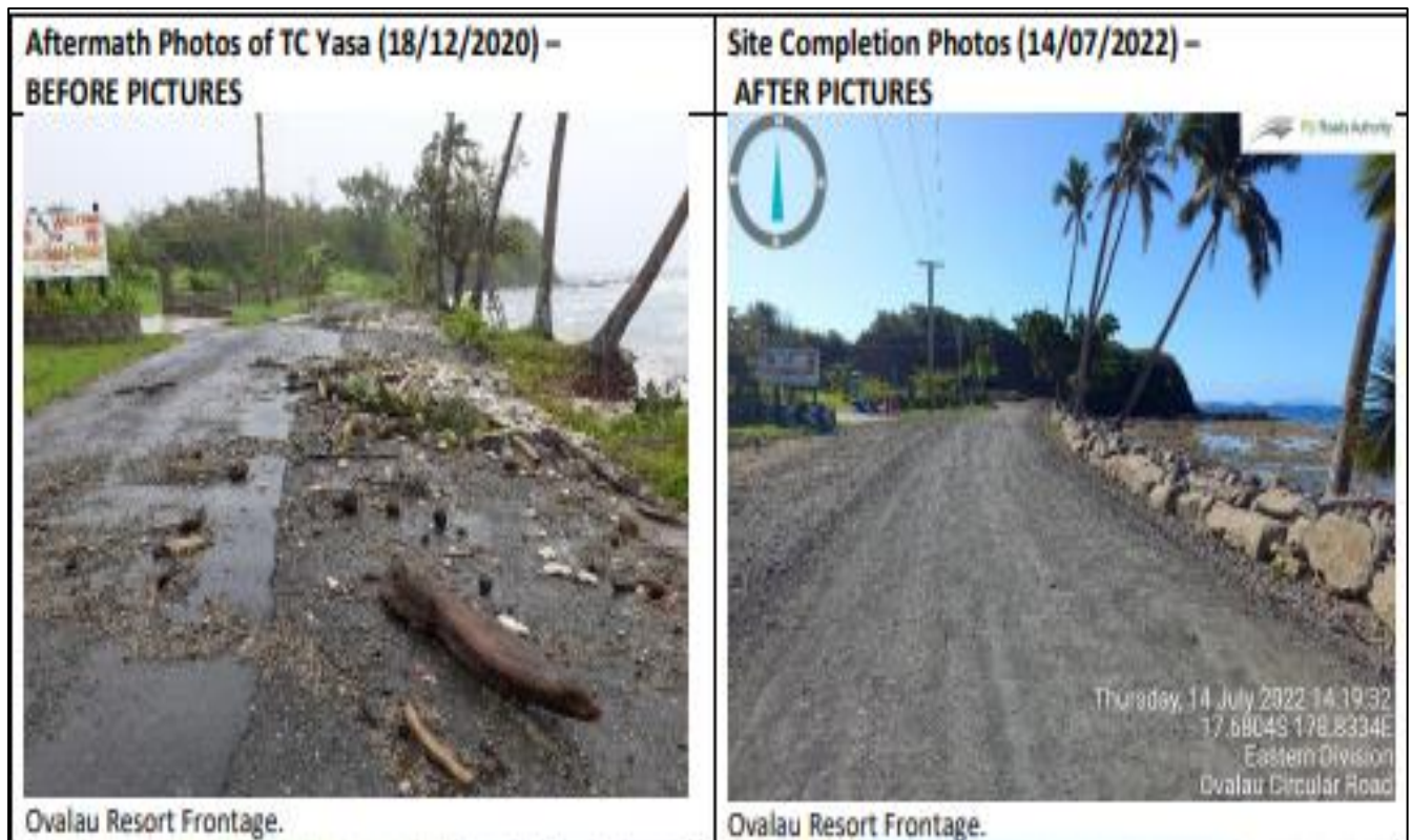
Figure 1 – Ovalau Frontage, Eastern Division

17. Many of these road and crossing were badly affected by TC Yasa and Ana; Divisional FRA Offices did remedial works and got these sections ready to be used by the public. Figures 1 – 9 shows some of the works done in the 3 Divisions.