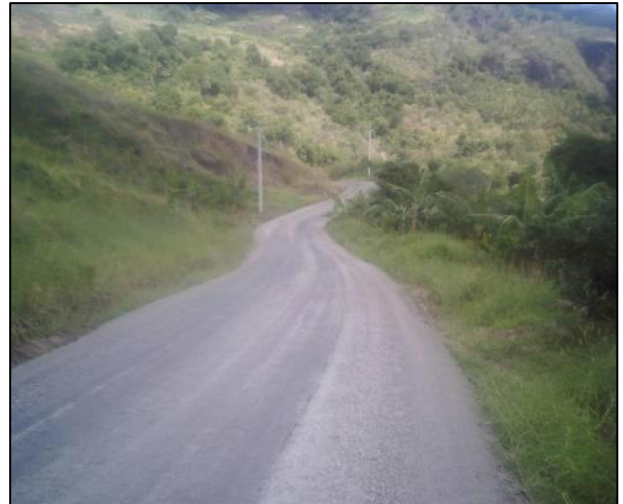
Figure 6 – Saioko Village Road, Western Division