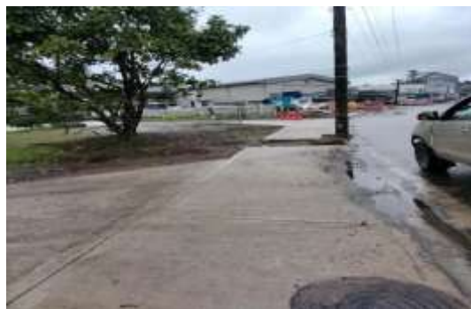
Figure 8: After Footpath upgrade works opposite Fiji Gas.