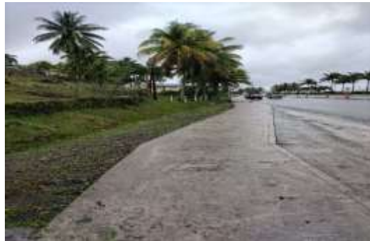
Figure 6: After Footpath upgrade works along Women Remand Centre.