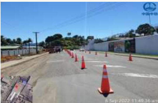
Figure 5: Before Road Upgrade Works.