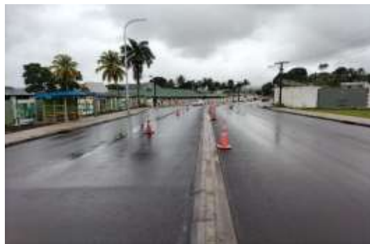
Figure 6: After Road Upgrade Works with raised median.