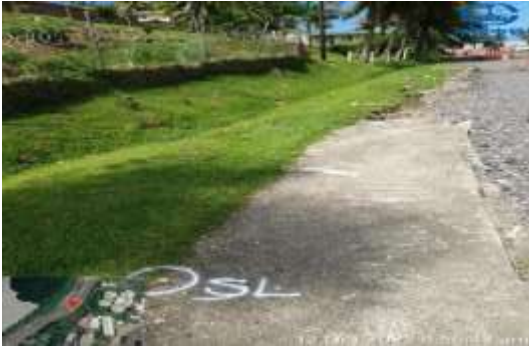
Figure 5: Before Footpath upgrade works along Women Remand Centre.