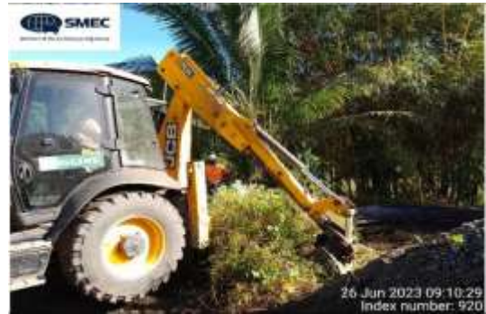
Image 2: shrubs and weed clearance.