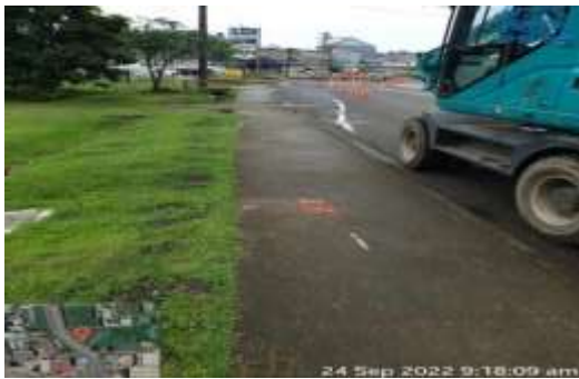
Figure 7: Before Footpath upgrade works opposite Fiji Gas.