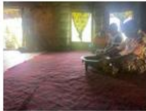
Figure 2- Meeting attendees