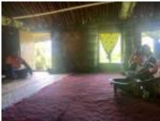
Figure 1- Meeting attendees