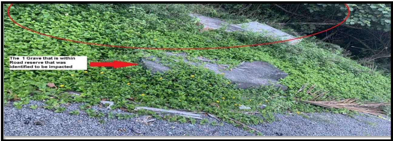
Figure 2 – Picture of Sautabu Burial Site (Confirmed Relocation Site)