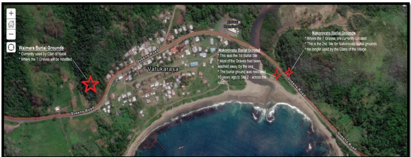
Figure 4 – Picture of Waimara Burial Site (Currently used by Clan of Nabili)