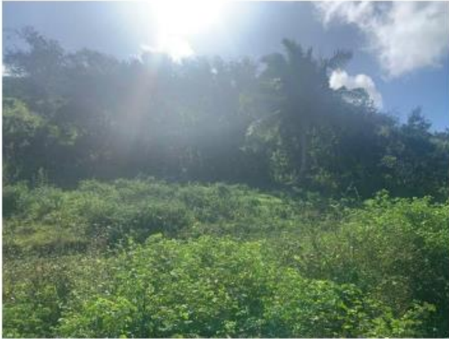
Figure 1- New grave relocation site.

CHINA RAILWAY NO.5 ENGINEERING GROUP (FIJI) LIMITED