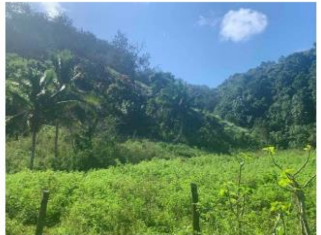
Figure 4- Relocation site