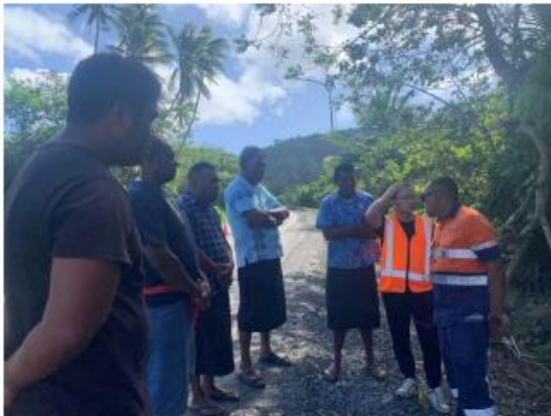
Figure 3- Site Visit