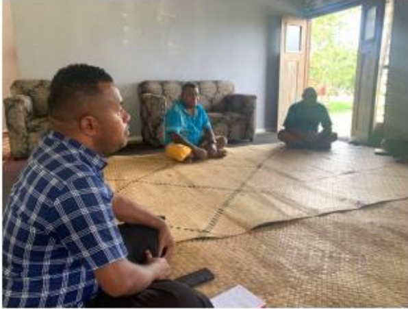
Figure 1- Meeting attendees