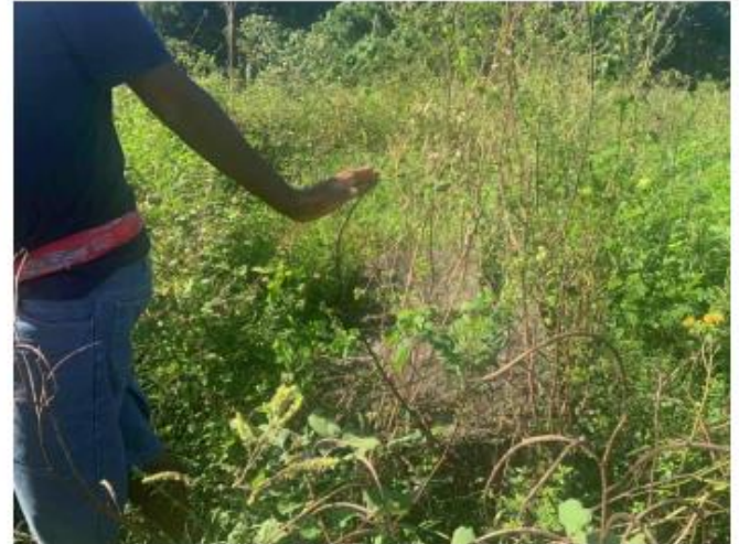
Figure 2- A grave at the relocation site.