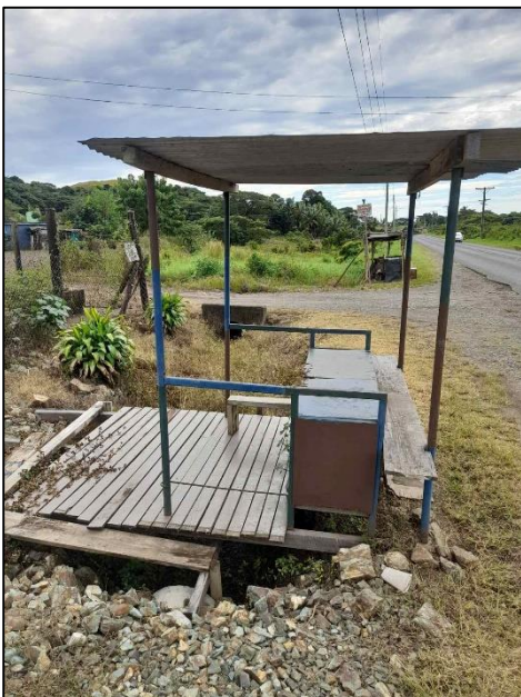
Temporary Stall with iron post and iron sheet roof.