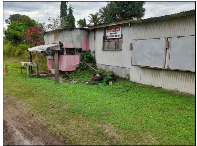
Temporary Stalls with wooden posts and tarpaulin roof covering.