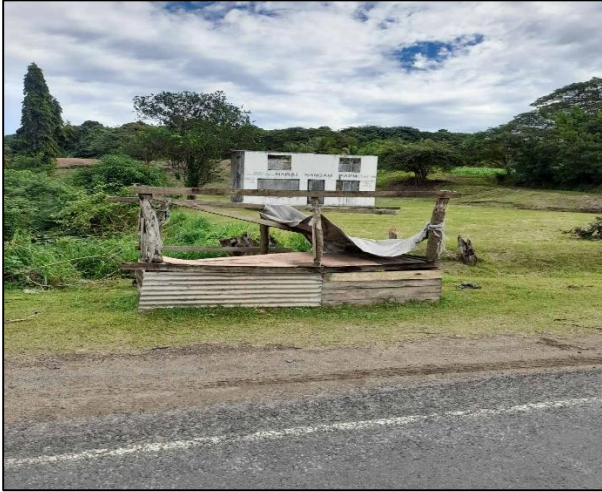
Temporary stalls with wooden posts and tarpaulin roof covering. Currently damaged and unoccupied.