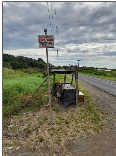
Temporary Stall with wooden post and tarpaulin roofing.