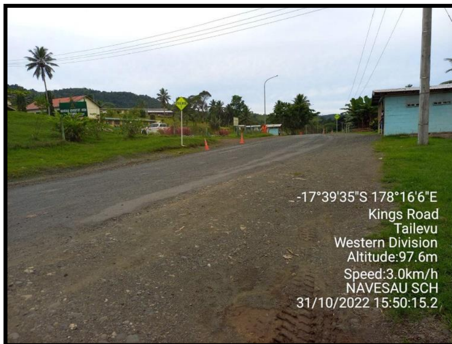
View from Opposite side of Drain Alignment Route – Within Road Reserve