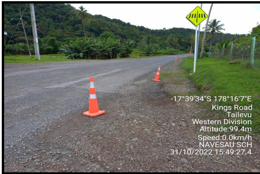
View of Drain Alignment Route – Within Road Reserve