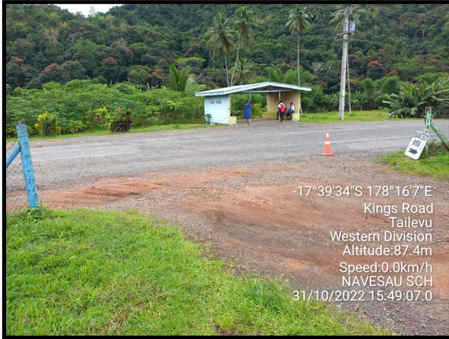
Earthen Drain to be constructed near School Entrance