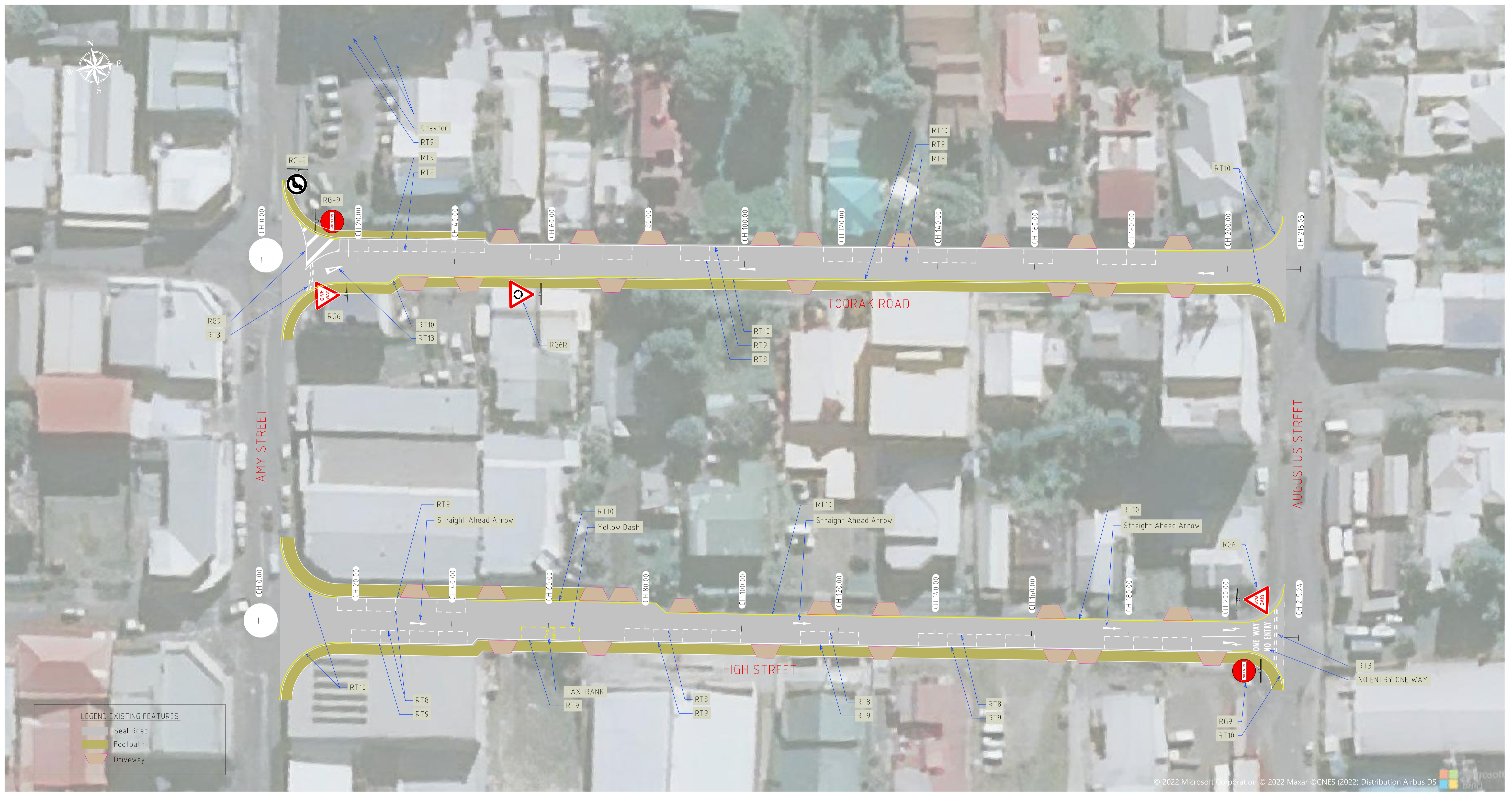
OVERALL LAYOUT PLAN