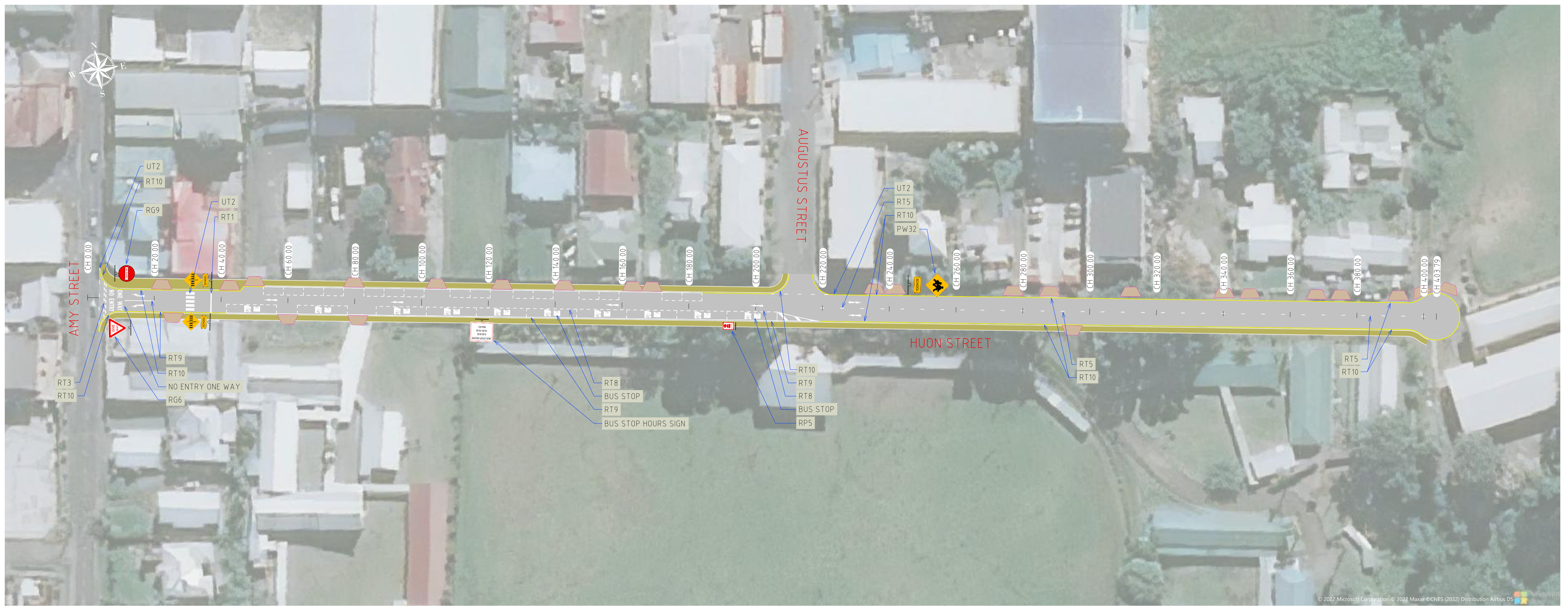
OVERALL LAYOUT PLAN Scale: 1600