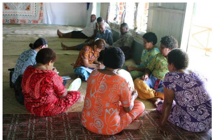
Figure 6: Women are isolated from the consultation for group discussion.