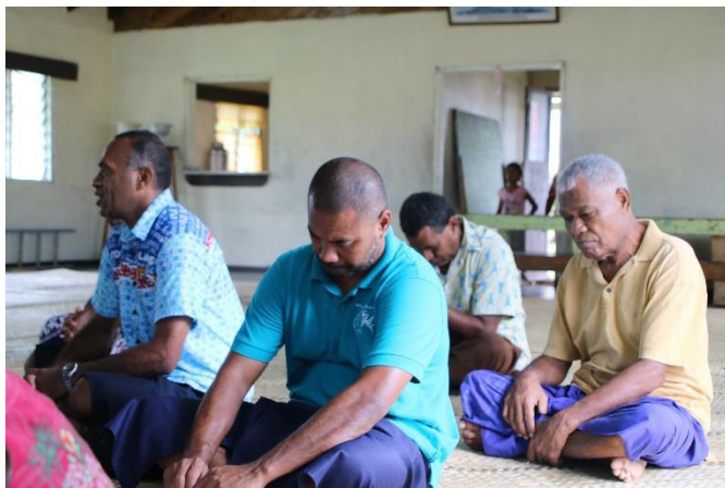
Figure 5: ADB Rep during the Public Consultation.