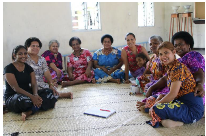
Figure 6: Minority groups (women) are isolated from the consultation for group discussion.