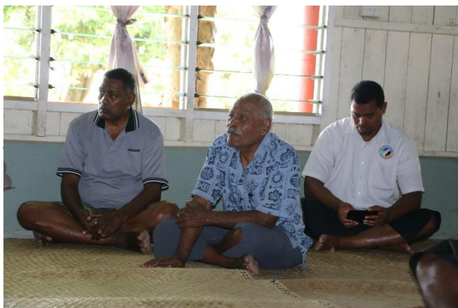
Figure 5: Participants during the Public Consultation.