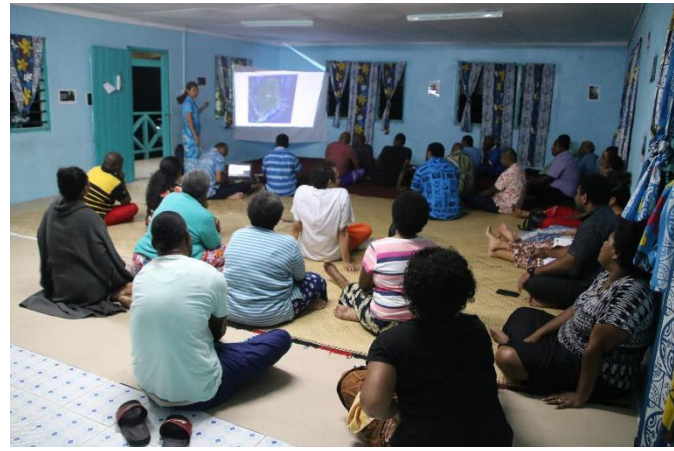
Figure 2: Miss Amor presents about the scope of works for the proposed project.