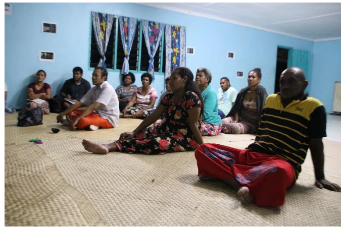
Figure 4: Participants listen during the Public Consultation.