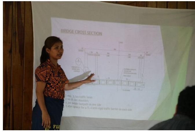
Figure 2: Miss Amor presents about the scope of works for the proposed project.