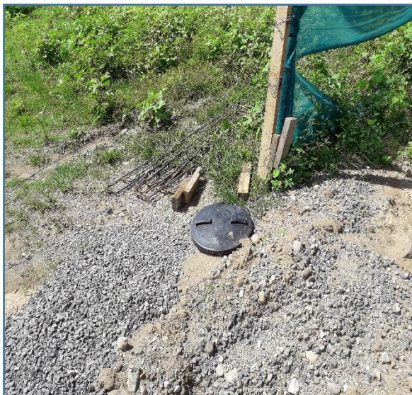
Photo 3 – Portable septic tank still installed and has not been removed off site.