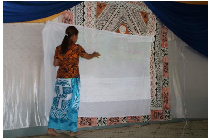
Figure 2: Miss Amor presents about the scope of works for the proposed project.