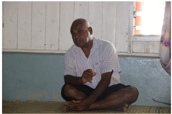
Figure 4: Chief enquired about land acquisition.