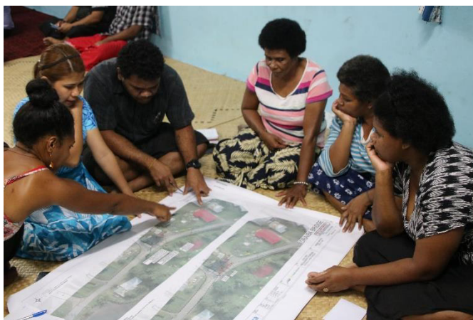
Figure 5: Discussion on challenges and potential solutions.