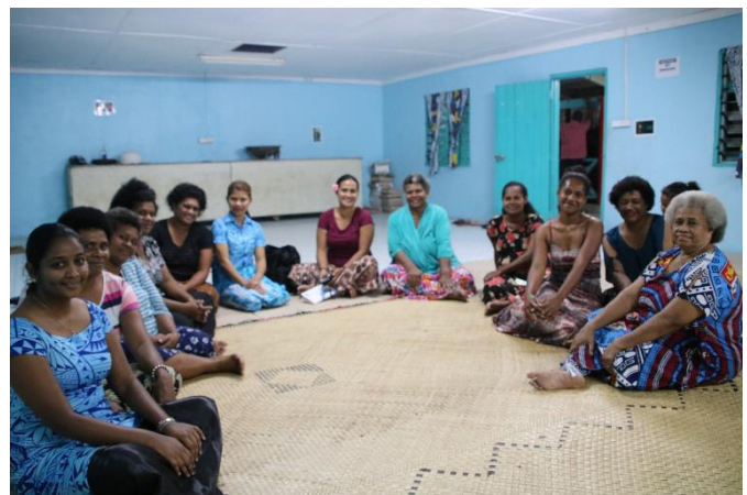
Figure 6: Minority groups (women) are isolated from the consultation for group discussion.