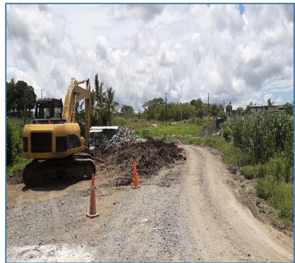
Photo 4 – No clear demarcation between the project site and temporary access road