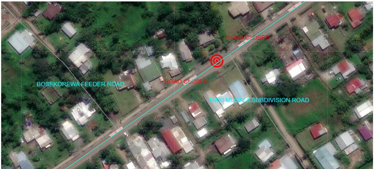
Residents staying inside and past Maki Musala Subdivision are requested to detour through the Nadali Bypass Road, off Wainibokasi Road.