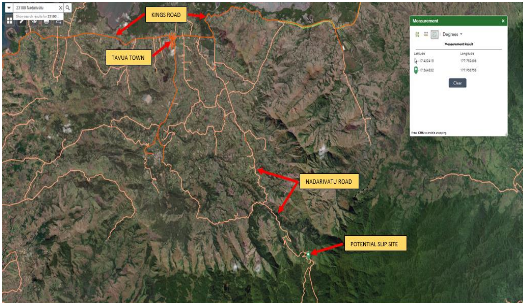
LOCALITY MAP 1: Location of Slip with respect to Tavua Toad