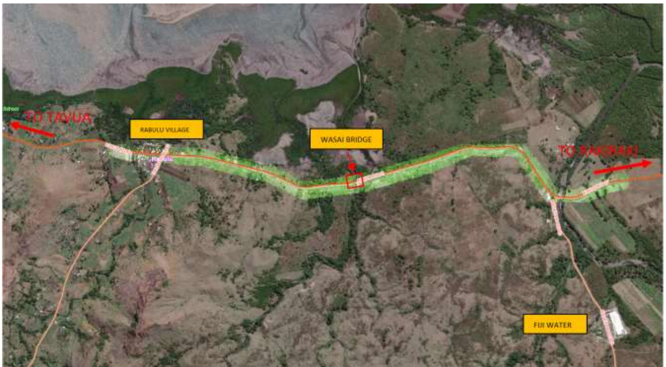
LOCALITY MAP 2: BLOWN UP MAP FOR LOCATION ENCIRCLED IN ORANGE IN MAP 1