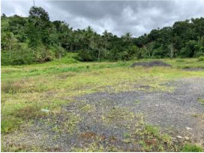
Figure 2 Matanipusi: Approved Area for Dumpsite/Stockpile Material