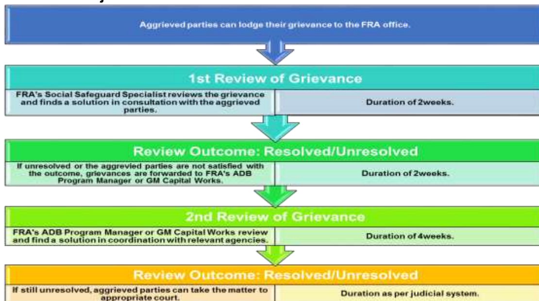
Figure 5.1: The Project’s CPC/GRM