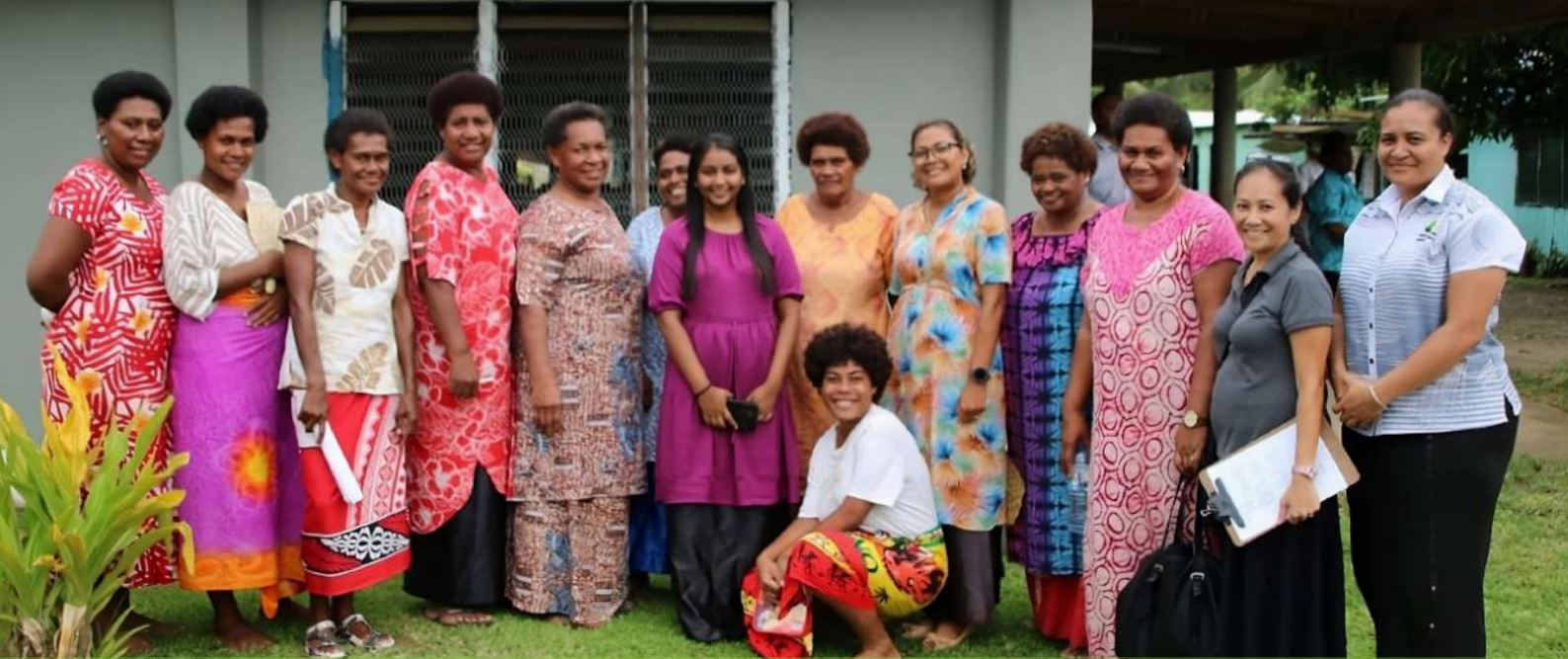
Caption: Focused group discussion with women, empowering dialogue on gender-sensitive road construction in local communities

flood resilience, and access to vital services such as markets, education, and healthcare facilities for local villagers, including women, children, and elders.