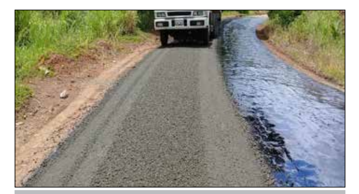
OTTA Surfacing Trial at Bocalevu Road in Labasa

FRA is pleased to announce that the Cunningham footpath project is now complete.