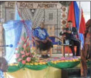
Hon. Prime Minister Voreqe Bainimarama with Gu Yu, Charge D'Affaires ad Interim, People's Republic of China during the opening of Stinson Parade Bridge