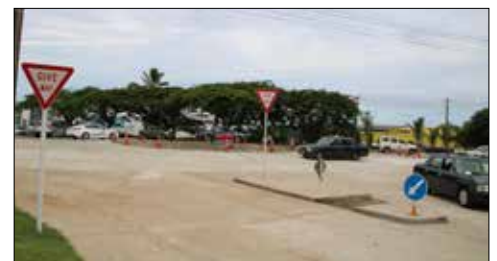
The Gaji / Grantham Roundabout is open to traffic after major roadworks. Works included upgrading the existing asphalt concrete road into a concrete surface roundabout, installation of safety island and the construction of roundabout kerb.