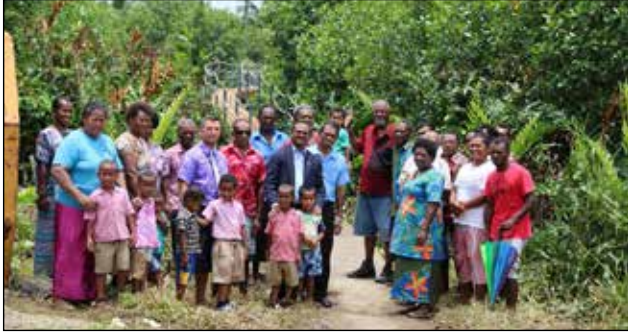
Assistant Minister for Infrastructure and Transport Hon Vijay Nath and FRA representatives with the Dibulu and Muanikoso communities.