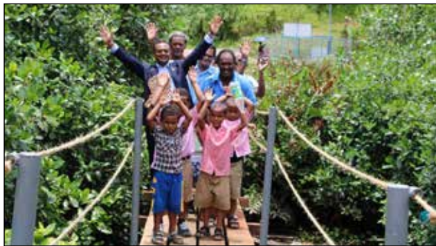
Assistant Minister for Infrastructure and Transport Hon Vijay Nath at the Dibulu Crossing

People of Dibulu and Muanikoso in Narere, Nasinu are grateful for the two footbridges following the successful completion of the much needed repairs by the FRA.