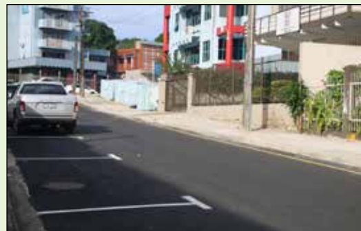
New and improved Kimberly Street in Suva

Roadworks on Kimberly Street in Suva is now complete and open to traffic.