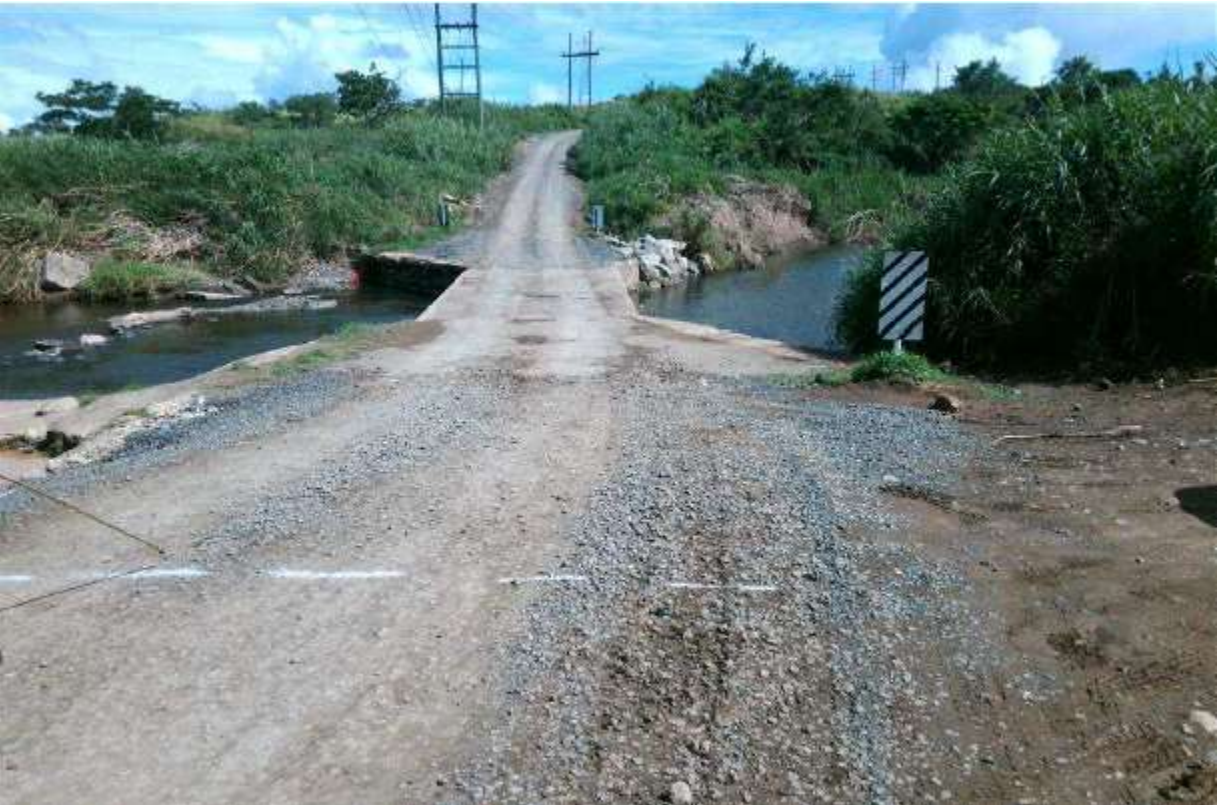
Photo Caption: Delainadi Crossing located on Vuda Back Road in Lautoka