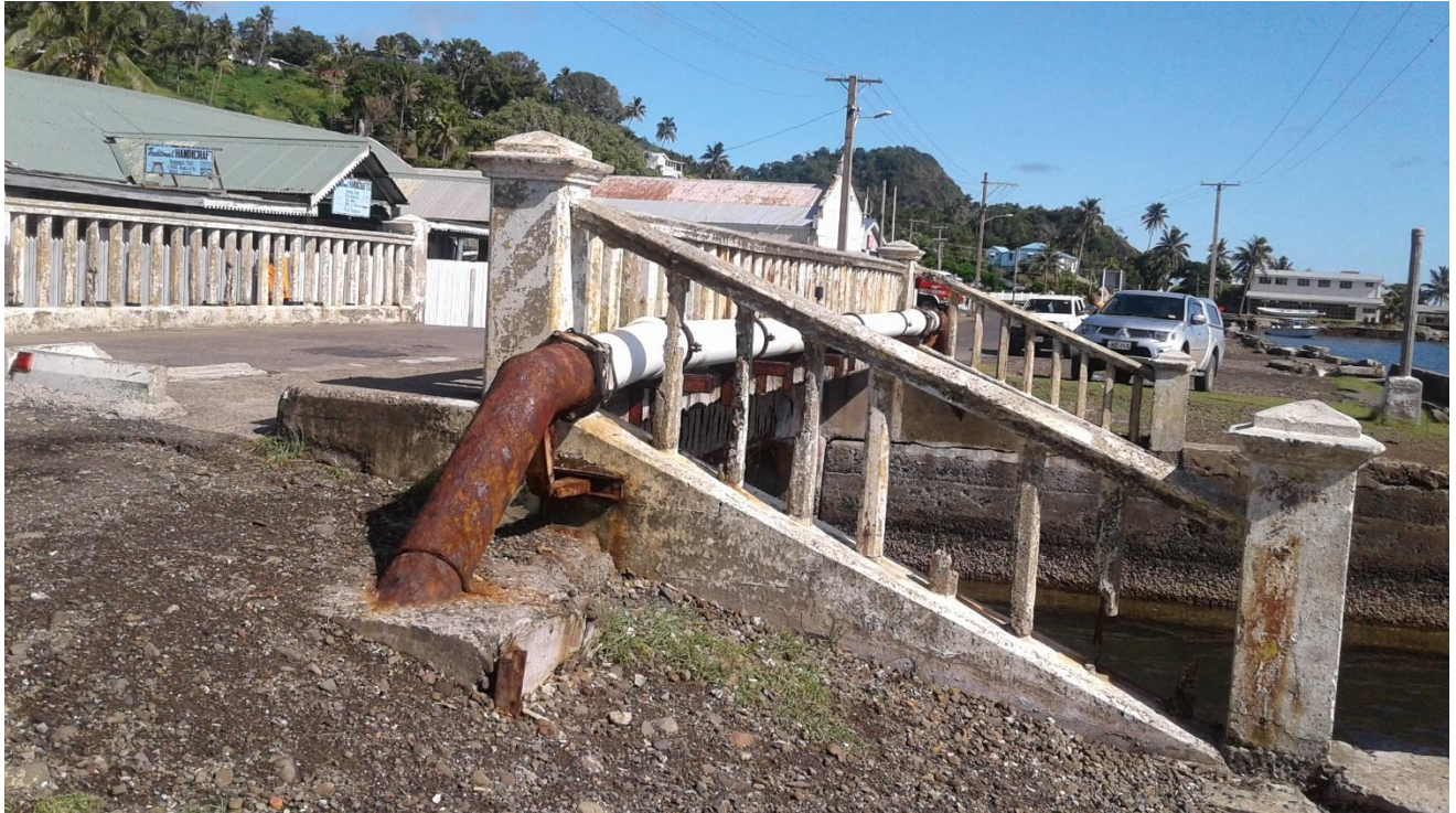
Picture Caption: The old Market Bridge in Ovalau, Levuka needing immediate replacement